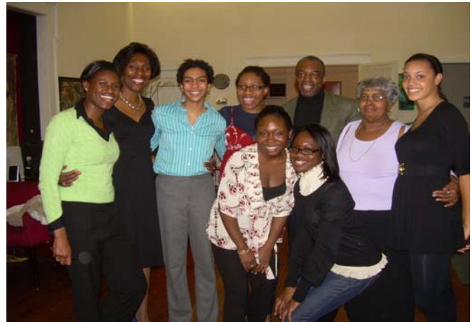
Harambee House Staff with LeVar Burton

Some highlights included: a month long art exhibit featuring local as well as student artists, a week long showing of "Roots" the acclaimed television mini-series based on Alex Haley's award-winning novel. The showing of "Roots" was accompanied by a lecture by LeVar Burton, who starred in "Roots" as Kunta Kinte in 1977. The lecture was extremely well attended by the entire Wellesley College community in Collins Cinema and followed by a lively reception at Harambee.