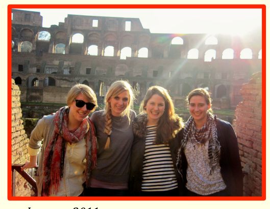
January 2011 Students in the Colosseo

January 2011 Students enjoying Italian pizza around the corner from Piazza del Viminale