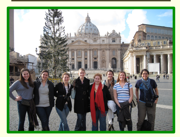
January 2011 Students in front of la Basilica di San Pietro in Vaticano

with Professor Flavia Laviosa Italian Studies 202 January 4-22, 2013