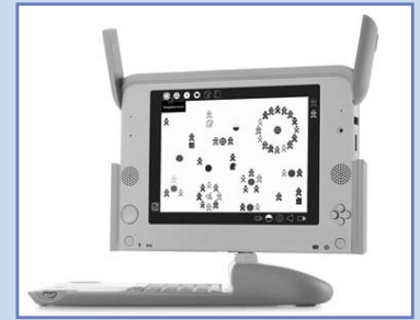
One Laptop Per Child's XO model

"We think that the greatest resource a country has is its kids," he explained in a speech at the Palo Alto Research Center. "Education is an essential component of the solution to all of the big problems that we have in the world these days." For more information, contact skakavou@wellesley.edu .