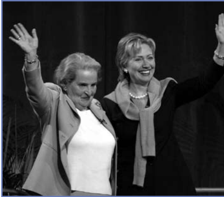
Madeleine Albright and Hillary Clinton at Wellesley's 125th anniversary celebration

Two Wellesley College alumnae have been named to leadership posts in the administration of U.S. President-elect Barack Obama. Sen. Hillary R. Clinton '69, has been nominated for secretary of state. When confirmed by the Senate, she will be the second Wellesley alumna to hold that role; Madeleine Korbel