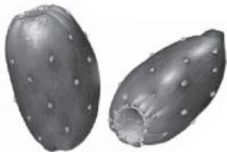
Opuntia ficus-indica prickly pear watercolor © 2008 Carrie Megan

Foundations or equivalent course required.