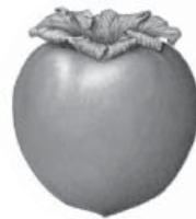
Diospyros kaki hachiya persimmon watercolor © 2008 Carrie Megan

In this four-day seminar learn about exotic produce in their native lands and see up close those growing in the Ferguson greenhouses. Observe, research and record them in drybrush watercolor. Sarah Roche's expert instruction will give you the skills to capture textures and tones and the vibrant colors of fruits and vegetables—your paintings will look good enough to eat.