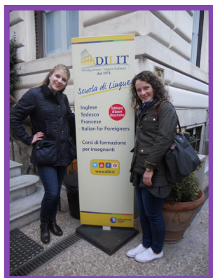
January 2015 Students outside of Dilit International School

This intensive three-week course is a full immersion experience in Italy. It consists of a fast-paced grammar review through the reading of literary texts and newspapers, oral discussions on Italian current events, and compositions on cultural topics. The course includes a rich program of guest speakers, such as university professors and artists, as well as movie screenings. In addition, students are encouraged to explore the historical and artistic sites of the city and use the language to interact with the Italian people.