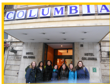
January 2015 Students outside of Hotel Columbia