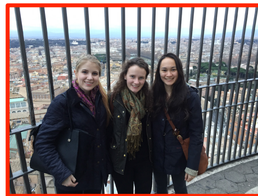
January 2015 At the top of the Basilica