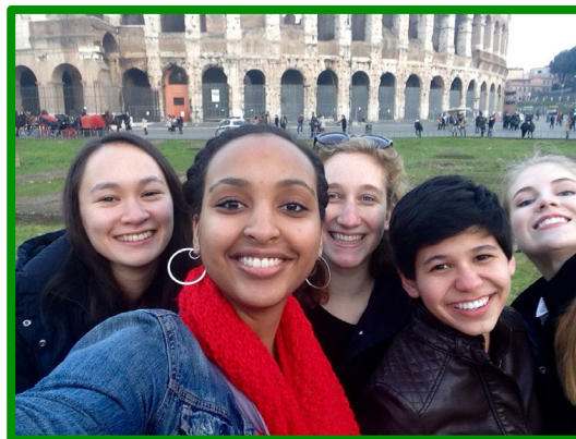
January 2015 Students outside the Colosseum

This 3-star hotel offers comfortable double rooms with en-suite bathrooms, refrigerators, HD TV, free Wi-Fi, and complimentary buffet breakfast. www.hotelcolumbia.com