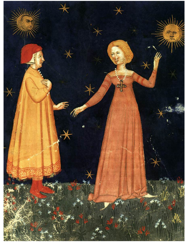
Left: Dante and Beatrice in a late fourteenth-century manuscript of the Divine Comedy (Venice, Biblioteca Nazionale Marciana, MS It. IX 276)

To engage with these women and give justice to their historical experience and presence in the world, the students of ITAS 263 had to come to grips with the lack of archival sources on marginalized groups and with the need to critically approach the representation of women in works of literature. In most cases, ITAS 263 students created the first and only online resource on these women in English. Their entries, which are now available online to every user of Wikipedia and were published last March, at the end of Women’s History Month, provide unbiased, well-rounded, up-to-date descriptions of these women’s lives and their contribution to the history of their time and beyond. Less than a month after the publication of the entries made or edited by Wellesley students, their entries have been viewed by over 150k users, and will undoubtedly contribute to many more readers of the Divine Comedy for years to come, well beyond the anniversary we are celebrating this year.