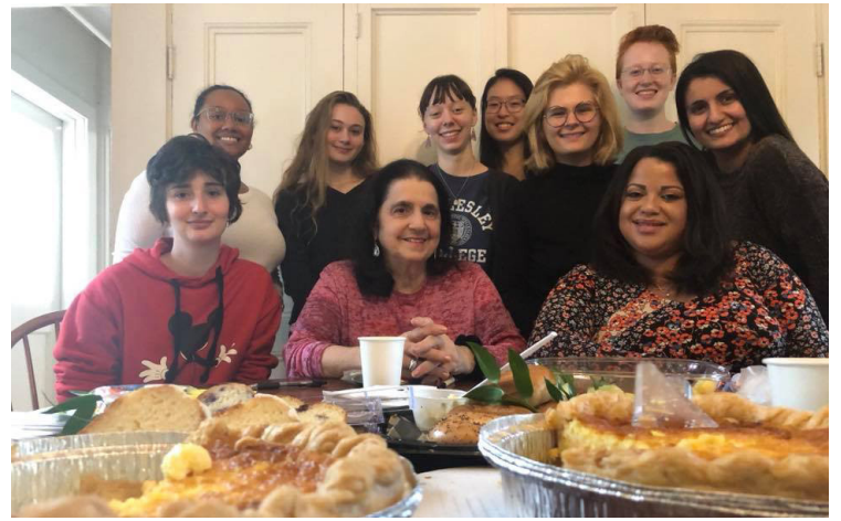
Welcome brunch with '18-'19 residents of Casa Cervantes