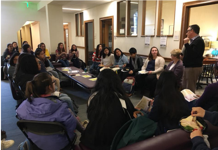
Fall 2018 Open House