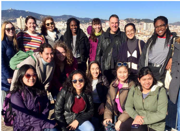
WS19 group, in Barcelona