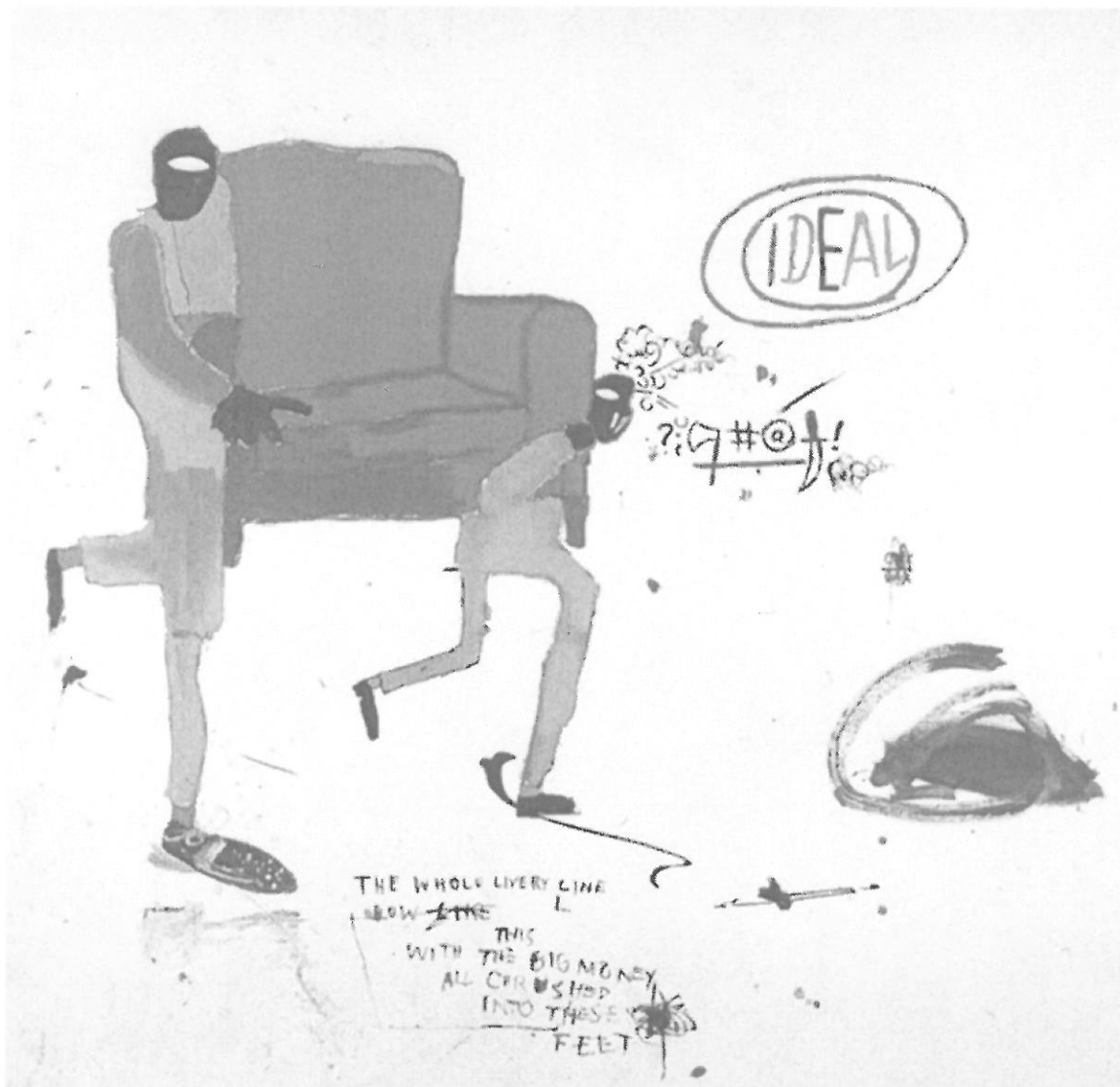
Figure 9. Jean-Michel Basquiat, Light Blue Movers , 1987. Acrylic, oil, and oil stick on canvas. http://www.thegroundmag.com/jean-michel-basquiat-1960-1988/light-blue-movers-basquiat-1987-the-ground/ .