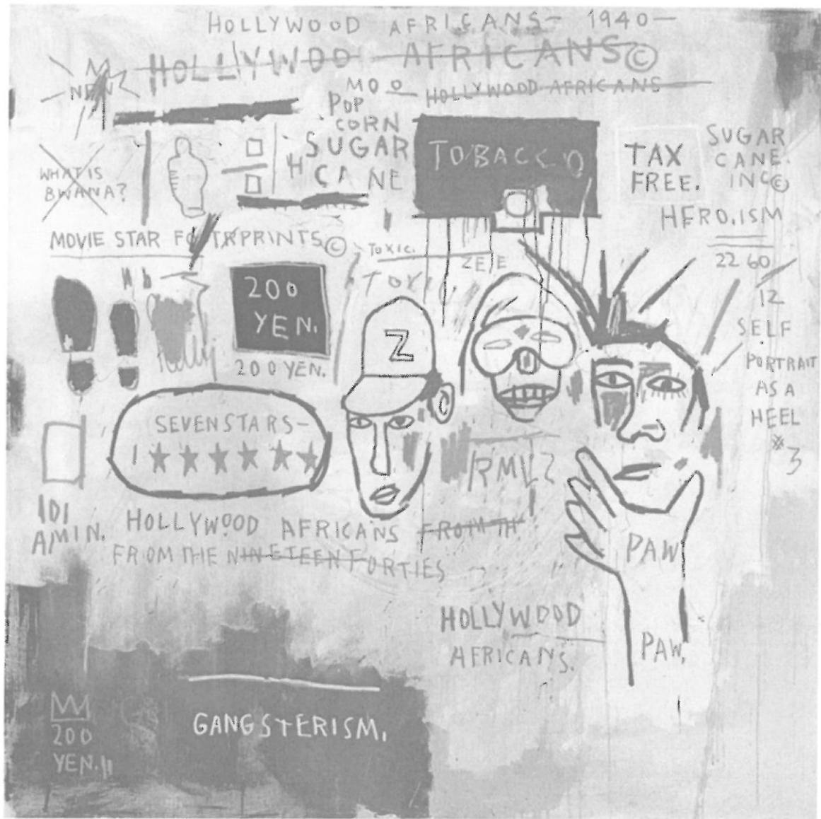
Figure 3. Jean-Michel Basquiat, Hollywood Africans , 1983. Acrylic and oil stick on canvas. http://collection.whitney.org/object/453 .