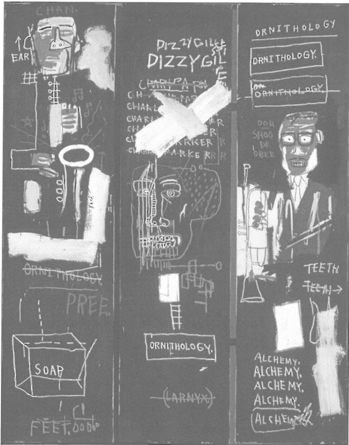
Figure 5. Jean-Michel Basquiat, Horn Players , 1983. Acrylic and oil stick on canvas panels. http://www.thebroad.org/art/jean-michel-basquiat/horn-players .