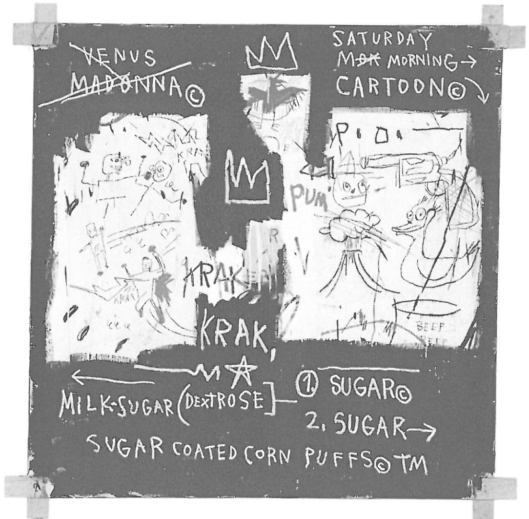
Figure 8. Jean-Michel Basquiat, A Panel of Experts , 1982. Acrylic, oil stick, and paper collage on canvas with exposed wood supporters. http://hyperallergic.com/205586/jean-michel-basquiat-and-the-immortal-black-life/ .