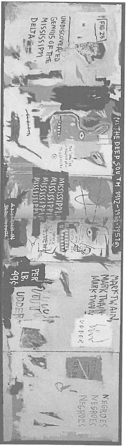
Figure 7. Jean-Michel Basquiat, Undiscovered Genius of the Mississippi Delta , 1983. Acrylic, oil stick, and paper collage on canvas panels. http://www.wikiart.org/en/jean-michel-basquiat/undiscovered-genius-of-the-mississippi-delta .